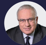
Alan Kohler, AM