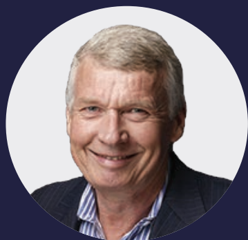
Paul Clitheroe AO